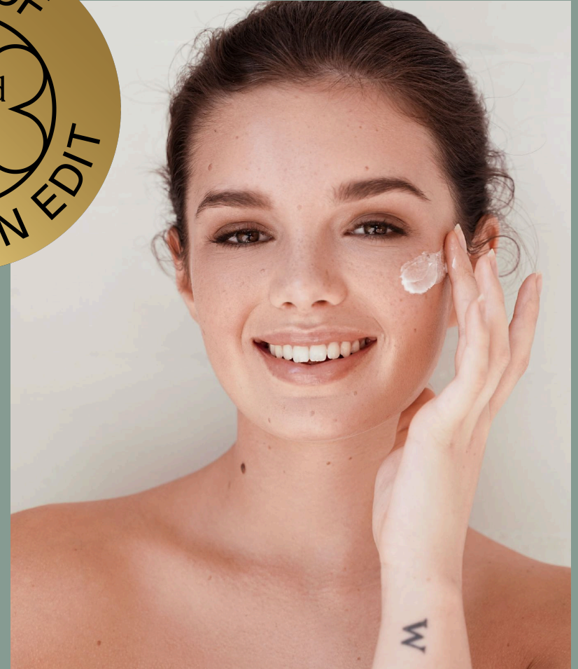
BEST OF THE GREEN EDIT AWARD INFO PACK